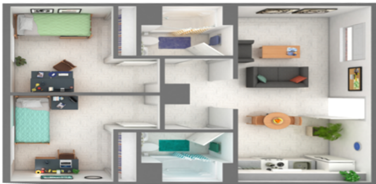
CULTURAL LIVING CENTER (CLC): Double