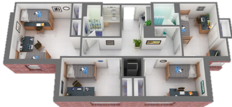
THE COMMONS: Five Person Suite Three Singles and One Double